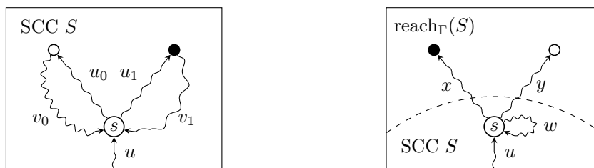
■ Figure 2 The origin of the words used in the proofs of Theorem 9 (left) and Theorem 10 (right).

to query any non-trivial language. Roughly speaking, the reason is that in order to query a non-trivial language in the variable-size model one has to know when the sliding window is empty. But for this, one has to maintain the size of the window, for which \log n bits are needed.